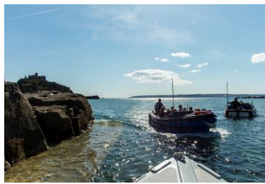
The boat journey over from Marazion