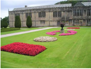
Lanhydrock House & Gardens

With so much to see and do a week will fly past and you'll have to choose carefully. Perhaps once you've packed the car you might like to visit Lanhydrock National Trust house and gardens, Bodmin or if you want an adrenaline rush why not stop by Adrenaline Quarry, Liskeard to have a go on the zip wire to get the heart pumping.