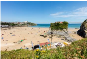
Towan Beach - Newquay

Newquay has a lot to offer with its Aquarium, zoo, wonderful beaches and gardens to explore. Why not head to the Zoo to spend a few hours enjoying the animals they have before heading down to one of the many beaches for an afternoon of surfing and digging in the sand. Towan Beach is in the town and easy to get to or there's Lusty Glaze just around the corner. Fistral is also a short journey away. If adventure is calling take a trip to Newquay Activity Centre to hire a surfboard, paddle board, maybe go for a paddle in a kayak or perhaps try Coasteering. Don't forget to take your voucher.