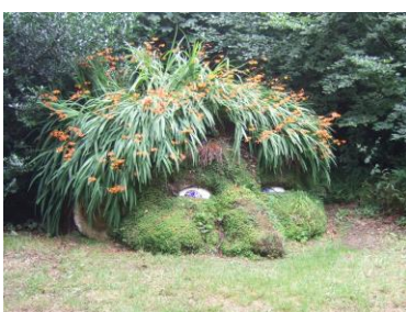
The Lost Gardens of Heligan

Perhaps explore one of the beautiful gardens around the area maybe a trip to the famous Lost Gardens of Heligan or the biomes of the Eden project. Both are a great day out and both just a short drive from Meadow Rise.