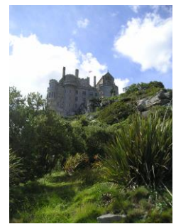
St Michaels Mount Garden