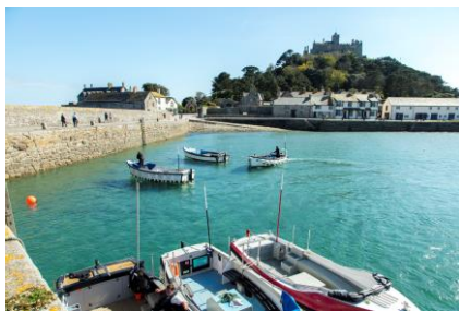
St Michaels Mount – Mounts Bay