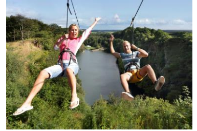
Zip Wire at Adrenaline Quarry

Whatever you choose to do we hope you have a great time and a safe journey home.