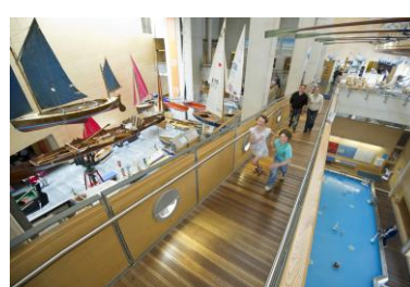
National Maritime Museum - Falmouth