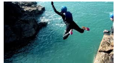
Coasteering with Newquay Activity Centre