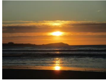
Sunset over Watergate Bay