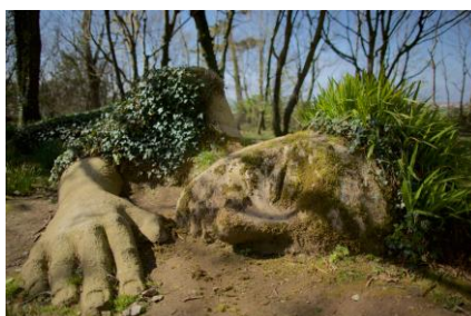
The Mudmaid at Heligan