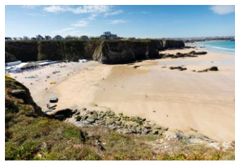
Lusty Glaze - Newquay