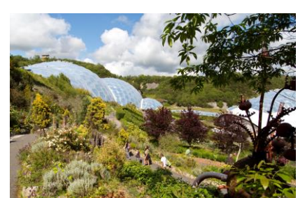
The Eden Project