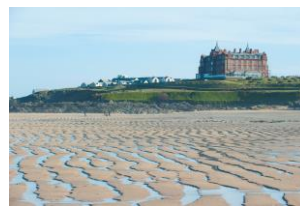
Fistral Beach - Newquay