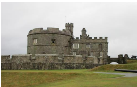
Pendennis Castle - Falmouth

Falmouth is a great day out with a variety of places to visit to make the most of your time. Why not try Pendennis Castle, a fortress built by Henry VIII to defend the country against invasion. Set on a headland with stunning views out to sea this castle has defended Cornwall since Tudor times and played a vital role in both World Wars. With lots to see and do for all the family it really is a place to visit.