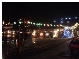
Christmas lights at Mousehole

If you are lucky enough to be staying over new year, then look out for the fireworks which you can watch from a safe vantage point on the cliffs and see them light up the night sky. Quite the spectacle.