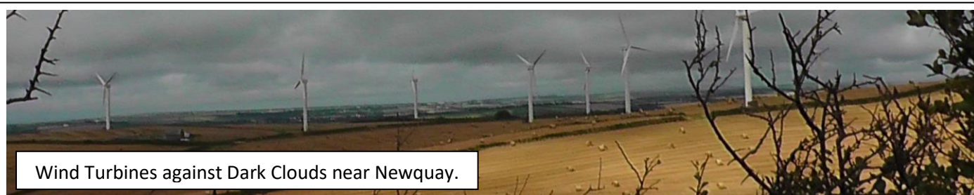
Wind Turbines against Dark Clouds near Newquay.