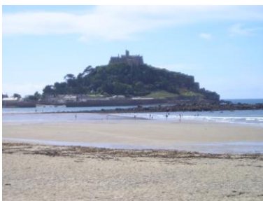
St Michaels Mount

If you haven't been to Cornwall before, then you really must visit St Michaels Mount, at Marazion in Mounts Bay. If you have been before its always worth another visit. It's a National Trust property so if you are a member you can get in for free though you will need to pay for parking and the ferry across. If the tides right you can walk across the Causeway. It has breathtaking views from the top, well worth the climb and the gardens are lovely.