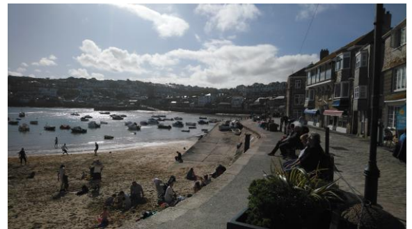
St Ives's overlooking the harbour