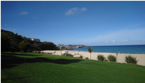
Porthminster Beach – St Ives

With St Ives just around the coast it's always a great place to visit. Famed for its clear skies and affinity with artists such as Turner and Barbara Hepworth, it has an abundance of art galleries along with offering shopping and a huge selection of food and drink outlets. The Tate Modern is just along the sea front and has many local artists exhibiting. If you have a yearning to be out on the open sea, why not hire a boat from the harbour. Or perhaps just a leisurely walk along the sea front to Porthminster beach.