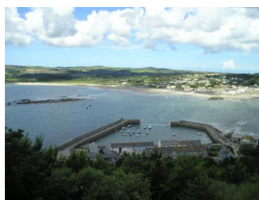
The view looking back to Marazion