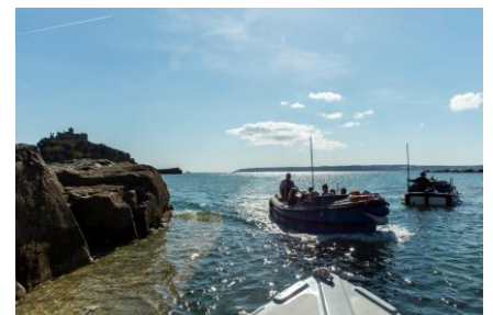
The Ferries across