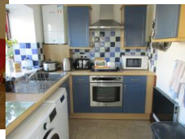
Meadow Rise makes a warm cosy base to relax in after a long walk