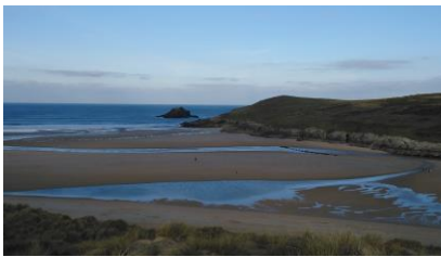
Crantock Beach – a beautiful dog friendly walk that will take your breath away

Watergate Bay – just a 10 minute drive from St Columb Major. Another lovely dog friendly beach to visit and walk along.