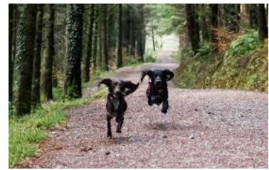
Cardinham Woods – Bodmin Great for dog walks, cycling or just a slow meander.