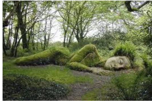
The Lost Gardens of Heligan