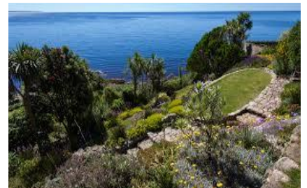
St Michaels Mount