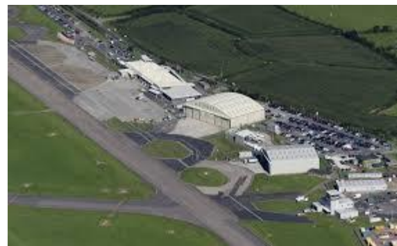
Cornwall Airport Newquay