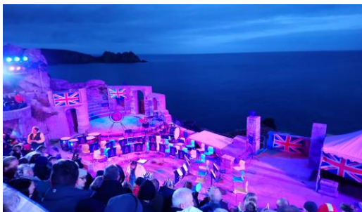
An evening performance at Minack

Follow on around the coast and pay a visit to the Minack Theatre. Open to visitors during the day or perhaps try and take in a performance, with the backdrop of the ocean it's a magical experience.