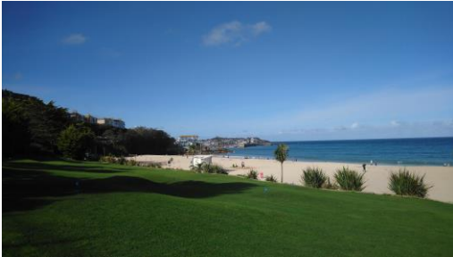
Porthminster Beach – St Ives

With St Ives just around the coast it's always a great place to visit. Famed for its clear skies and affinity with artists such as Turner and Barbara Hepworth, it has an abundance of art galleries along with offering shopping and a huge selection of food and drink outlets . The Tate Modern is just along the sea front and has many local artists exhibiting. If you have a yearning to be out on the open sea, why not hire a boat from the harbour. Or perhaps just a leisurely walk along the sea front to Porthminster beach.