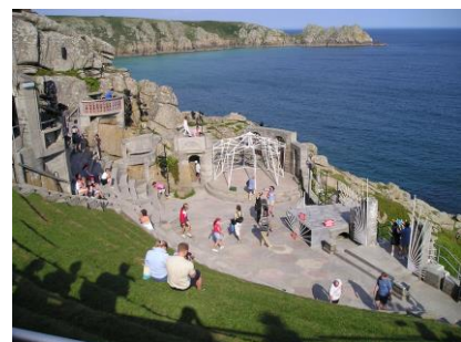
A day visit to the theatre