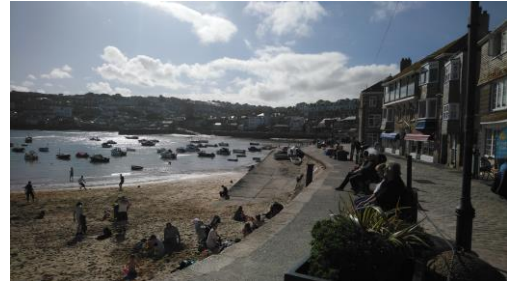
St Ives's overlooking the harbour.